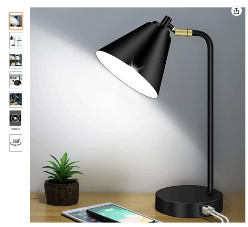
Roll over image to zoom in